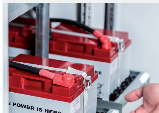
Fig.1 TTC Wärtsilä JOVYBATT BC